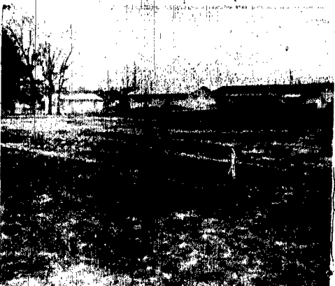
TWO SKATING ponds for ice skaters in Wayne are contemplated this year. In addition to the one in the southeast part of town, this area west of the swimming pool is being readied for skating.

Free Show Saturday in Wayne for all the Kids — 1:30 p.m.