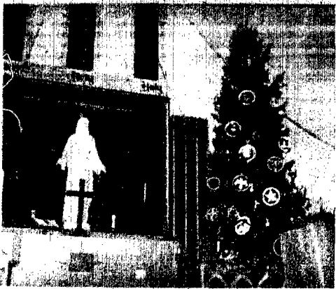
REDEEMER LUTHERAN church has its Christmas decorations on the tree. All in white and gold, this is the way they look.