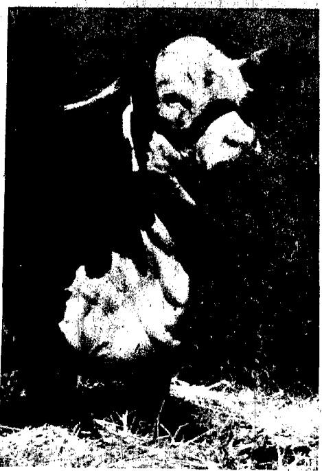
DIAMOND LIL, a cow owned by Hervale Farms, Wayne, brought $5,000 at a sale in Illinois last week as grand champion female of a national show.

Next week's issue of The Wayne Herald will be the Christmas greeting edition. Any business not contacted by Tuesday noon and wishing to be included should call The Herald at 375-2800. A Christmas coloring contest is also a part of the Christmas greeting plan. Cash prizes will be offered in two divisions for youngsters coloring or painting ads from the paper. Parents are asked to call the contest to the attention of the youngsters. A Herald representative will call in Carroll, Concord, Dixon, Winsted and Hoskins for signatures on community Christmas greeting ads (each community having a separate ad). Anyone "off the beaten path" in any of those towns wanting to be included should notify businessmen in the main business district.